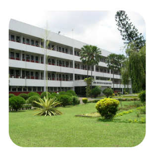
Saha Institute of Nuclear Physics (SINP)