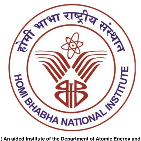
(An aided Institute of the Department of Atomic Energy and a Deemed to be University u/s 3 of UGC Act 1956) www.hbni.ac.in