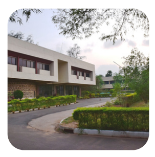
Institute of Physics (IoP)