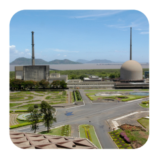
Bhabha Atomic Research Centre (BARC)