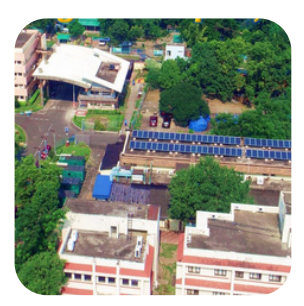
Variable Energy Cyclotron Centre (VECC)