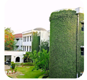
Harish-Chandra Research Institute (HRI)